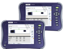
Compact multilayer platform for network installation and maintenance