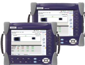
Scalable platform for multiple-layer and multiple-protocol testing