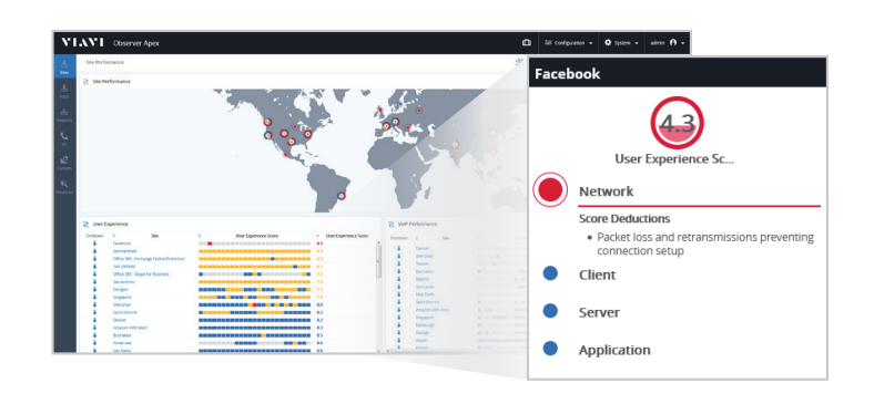
Centrally Managed End-User Experience, Performance and Security

Centrally Managed End-User Experience, Performance and Security. The power of VIAVI Observer APEX is now available in AWS and offers comprehensive real-time visibility of critical applications hosted in AWS or on-premise in the Data Center. APEX provides a centralized platform to analyze and troubleshoot application performance issues utilizing our patented End-User Experience scoring. For network security, APEX helps investigate and document incidents of concern or confirmed security breaches by providing in-depth post event forensics. APEX can reside in AWS or on-premises in the Data Center.