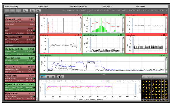
PathTrak Dashboard in WebView™

Same impairments visible with Field View QAM