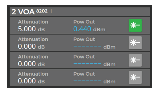
Figure 1 \, – mVOA MAP-300 summary view GUI

An intuitive graphic user interface (GUI) is optimized for use in either a laboratory or a manufacturing environment. Efficient transition between summary and detailed views (figure 1 and figure 2) allow users to operate at a system level or access the full power of a module