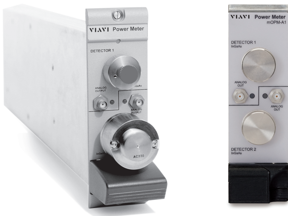
Figure 1 Installing the Integrating Sphere

The AC330 accessory can be directly screwed onto the front panel of the MAP-200 Optical Power Meter Module, as shown in Figure 1.