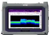
CellAdvisor 5G Cell site test solution