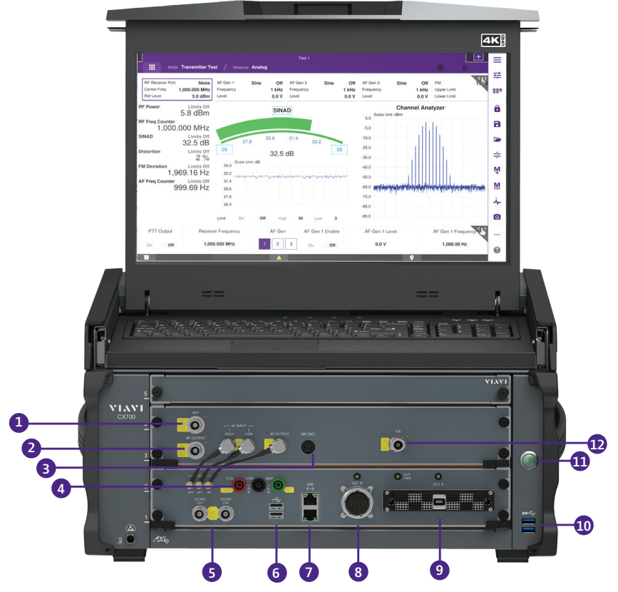
Figure 1 CX700 Front Panel Connectors

The CX700 front panel contains a comprehensive selection of input and output connectors to support a wide variety of devices.