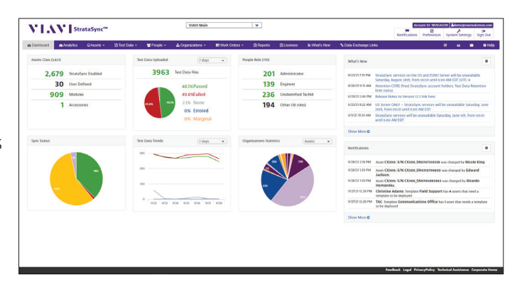
Smart Access Anywhere

StrataSync is a hosted, cloud-based software application that provides asset configuration and test-data management from anywhere in the world. The CX700 lightens your workload by synchronizing your test results to the cloud and keeping your test set updated with the latest software. Easily save and access test results for both manual and automated tests.