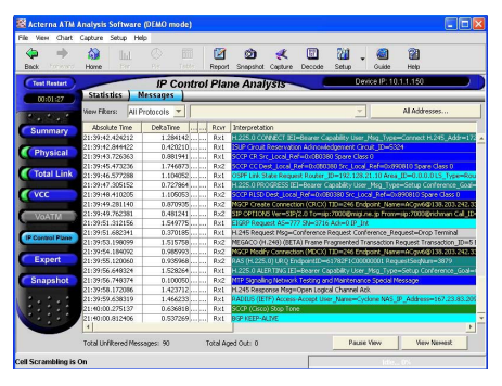
IP control plane analysis

The ATM Analysis Software allows technicians to display protocol decodes in real time. Summary, hex, and detailed decode views are available for over 350 protocols.