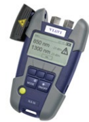
Optical Light Source