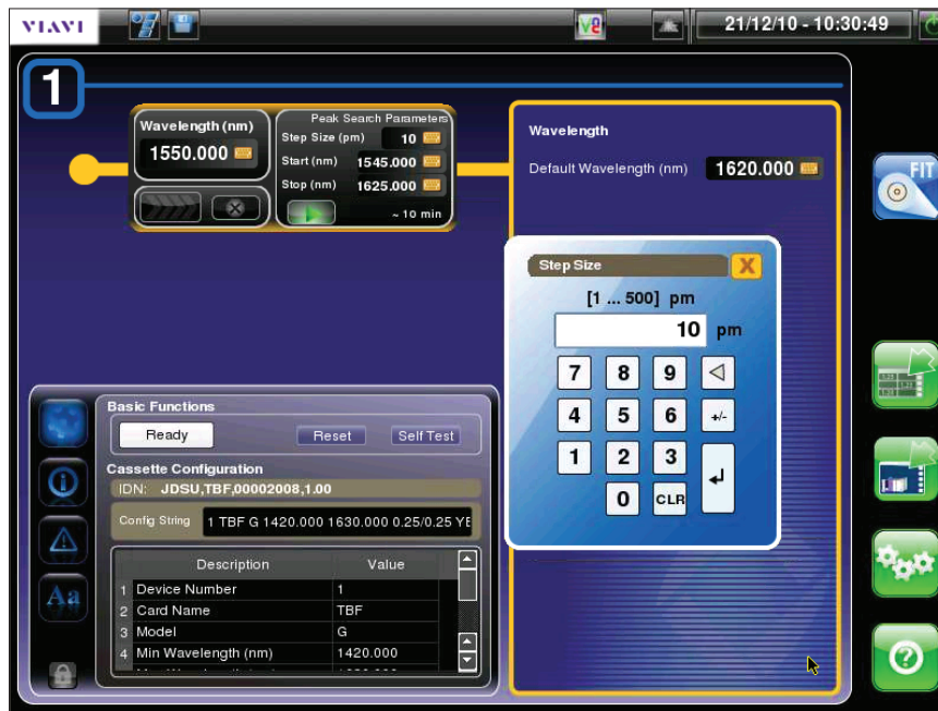
Figure 2. mTBF GUI - detailed view

The filter makes use of a diffraction grating to separate the input light along several discrete paths. A stepper-motor rotates the grating to transmit the desired wavelength along the output fiber.