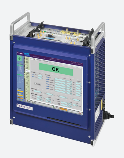
Trusted by Engineers for More Than 100 Years