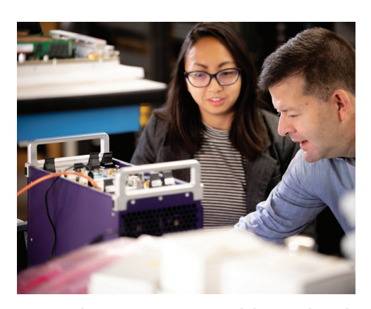
Personal customer support and deep technical expertise you have come to expect from VIAVI