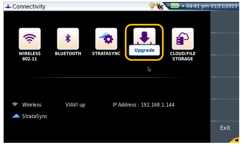
Figure 5: Connectivity Menu

8. Follow screen prompts to complete the software upgrade.