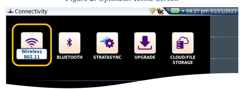
Figure 3: Connectivity Settings