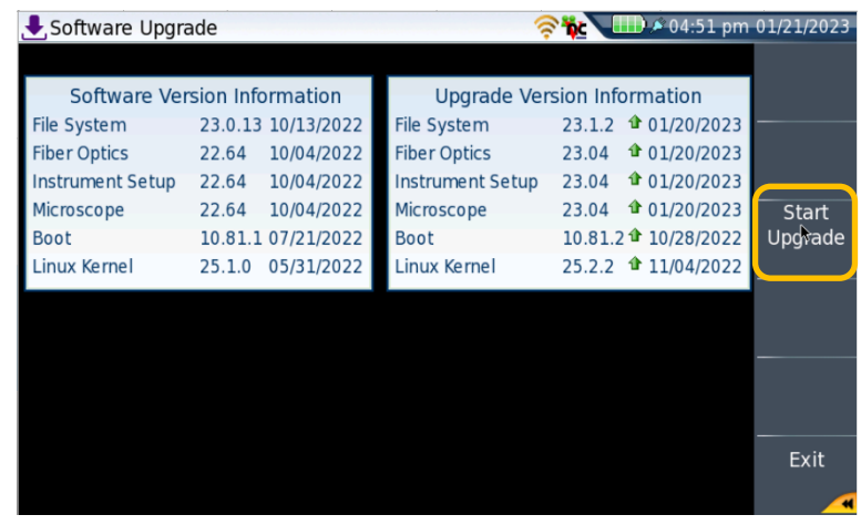
Figure 8: Start Upgrade