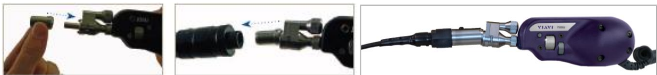
Figure 13: OptiTip Patch Cord