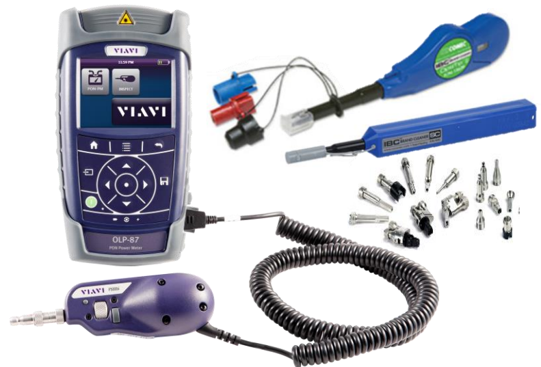
Figure 1: Equipment Requirements