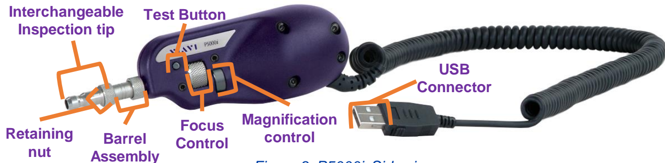
Figure 3: P5000i, Side view