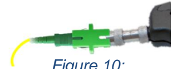
Figure 10: SC APC Patch Cord and Coupler