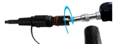
Figure 12: OptiTap Patch Cord