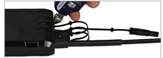
Figure 6: PushLok Bulkhead