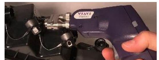
Figure 8: OptiTip Bulkhead