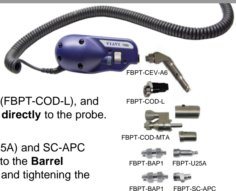
Figure 2: P5000i, Barrel Assembly and Tips