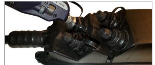
Figure 7: OptiTap Bulkhead