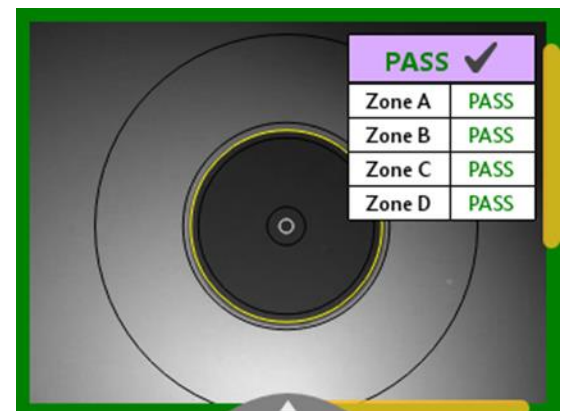
Figure 14: Pass/Fail Analysis