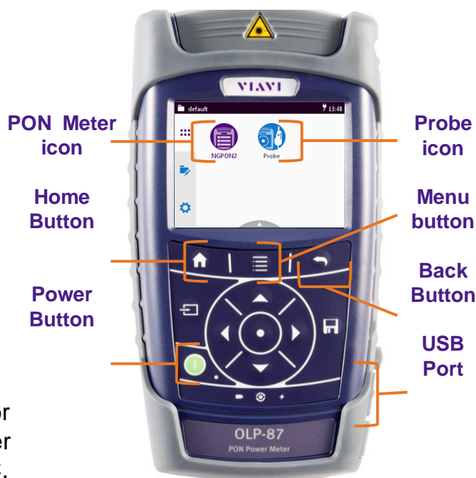
Figure 4: OLP-87, Front View

Note: If the Tip Selection is not shown, connect the OLP-87 to a PC with FiberChekPRO™ software using a USB to MicroUSB cable, and move the appropriate tip setting onto the OLP. For more information, consult the FiberChekPRO user manual. To download FiberChekPRO to your PC, visit http://fcpro.updatemyunit.net/ .