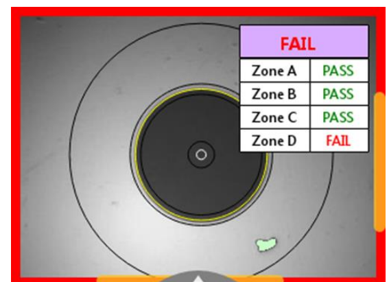
Figure 9: Pass/Fail Analysis