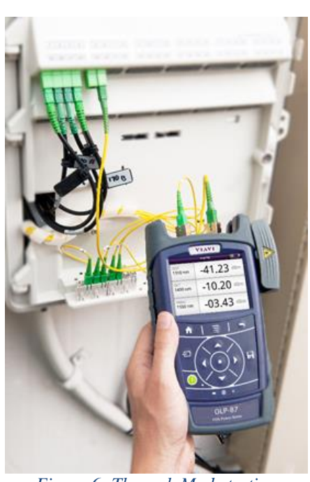
Figure 6: Through Mode testing