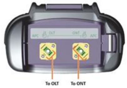
Figure 5: OLP-87, Top View