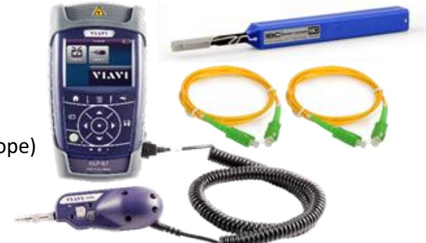
Figure 1: Equipment Requirements