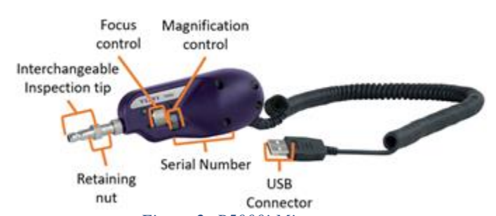
Figure 2: P5000i Microscope