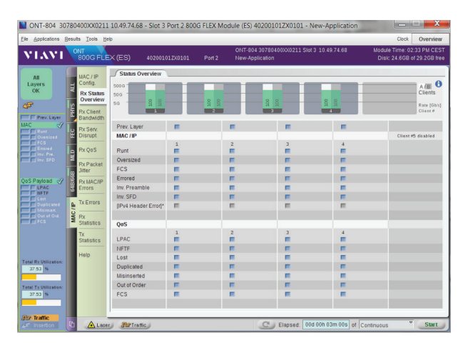
Figure 2 – ONT-804 with 800G Flex Module, MAC Rx Status Overview per 100GE link