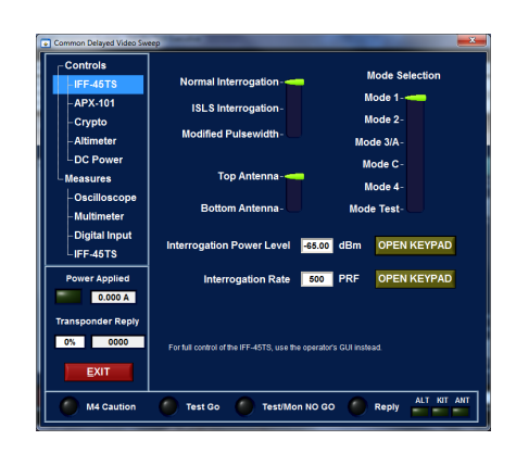
VirtualPanel software example for manual control of LRU