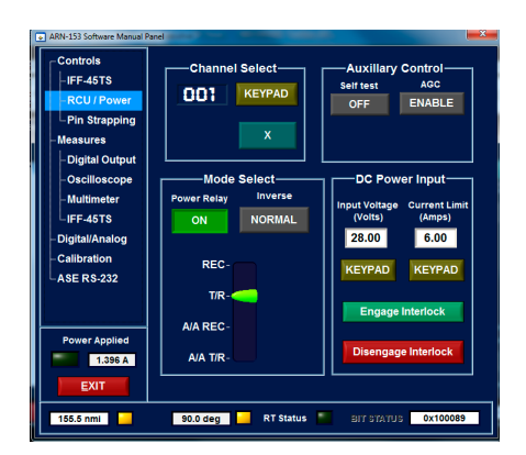
VirtualPanelsoftware example for manual control of LRU

-001, -002, -003, -004, -007, -008, -011, -012, -013, -014, -061, -064