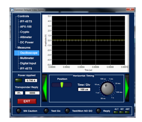
VirtualPanel software example for manual control of scope