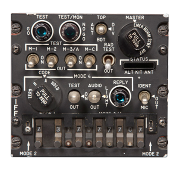
Variants (RT-): 1284A, 1284B, 1285A, 1285B, 1286A, 286B, 1296A, 1296B, 1557, 1557A, 1558, 1558A,

Technical Manual, Intermediate Maintenance with Illustrated Parts Breakdown Transponder Set, AN/APX-100(V) TM11-5895-1037-30&P 15 August 1998 Change 4 - 15 June 2007