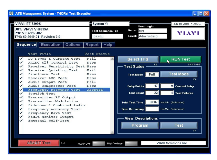
User Interface - A typical test script