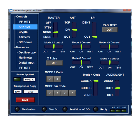
VirtualPanel software example for manual control of LRU