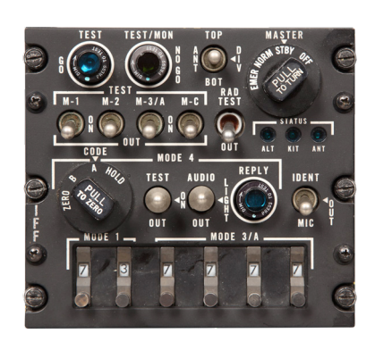
Variants (C-): 10009, 10532, 10533, 10534, 12039, 12040, 12197