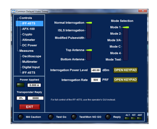
VirtualPanel software example for manual control of LRU