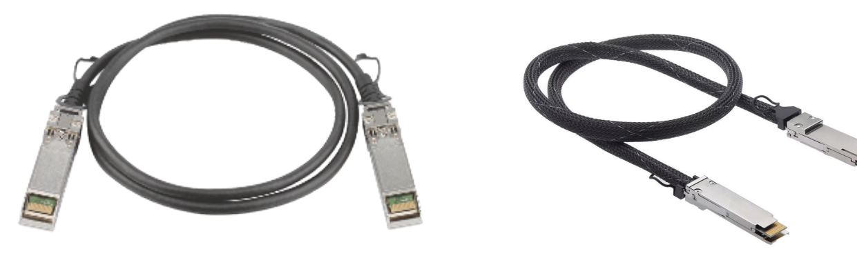
Figure 1. DAC Cable

AECs are relatively new and aim to match the transmission rates of AOC cables (at shorter distances), but more economically. AECs are narrow gauge copper cables with industry standard connectors at each end. Its active cables are mainly used for the connection of top of rack servers, distributed chassis, and up to 500 cables per rack. AEC active cable supports transmission rates of 100G, 200G, 400G, optics types include OSFP56. OSFP. OSFP-DD.