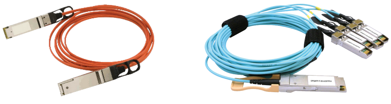
Figure 3. AOC Cable

Active Optical Cables (AOC) as shown in Figure 3 and Figure 4 are used in point-to-point and break-out interconnect applications in data centers, most often within the same rack or row. AOC cables were designed to fix capacity and reach problems in the world's data centers. Traditional copper cabling used in data centers was heavy, making moves, adds, and changes very difficult. In addition, EMI given off by data center equipment hampered transmission performance on the copper cables, often significantly. AOCs are naturally immune to EMI, and are also lighter, thinner, and have a longer range than the DAC and AEC. For example, an AOC cable can transmit at 400Gbps for 100 m compared to only 2 m for DAC and 7m for AEC. The AOC is actually an active assembly which explains its greater range and higher cost, and is comprised of transceivers, control chips, modules fused to either end, and the fiber optics cable. When selecting cables, the length, data rate, and transceiver type must be chosen with some certainty because they cannot be changed once the AOC is manufactured. Figure 4 shows an example of breakout cable (DACs and AECs also have breakout options) such as 4x10GE, 4x25GE, or potentially 4x100GE.