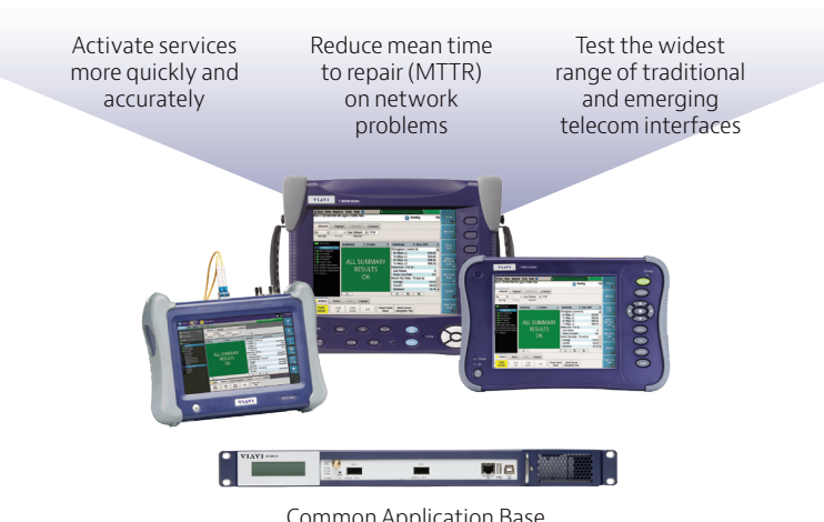
Common Application Base Same user interface + same results + same methods and procedures