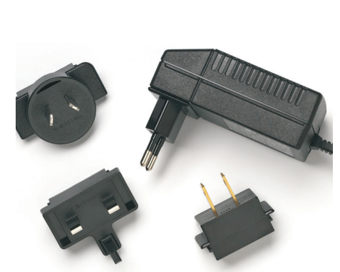
Worldwide compatible AC adapter (SNT-121A)