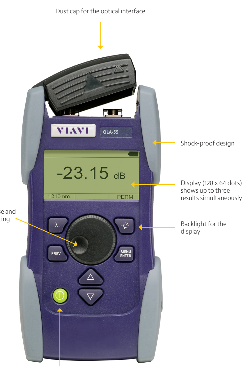
Power-on, auto power-off (after 20 min)