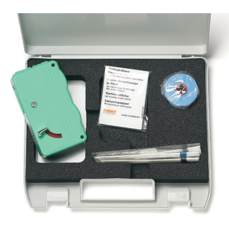
OCK-10 Optical Connector Cleaning Kit (accessory)