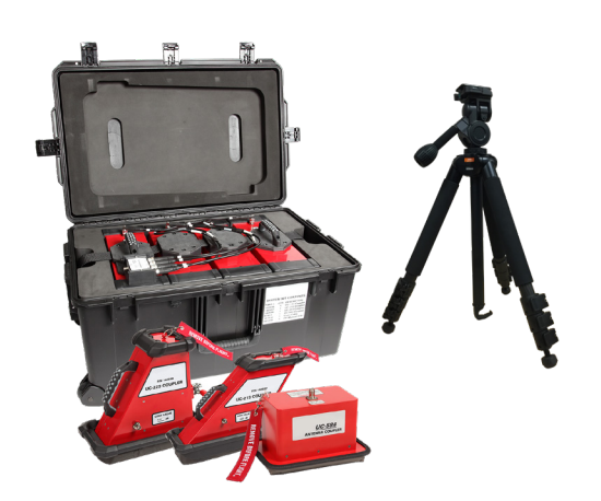
F-16 IFF Coupler Kit, p/n 140600