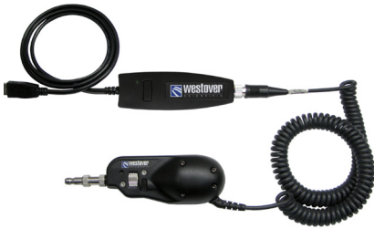
FBP-MTS-001 (T-BERD/MTS Upgrade Kit)