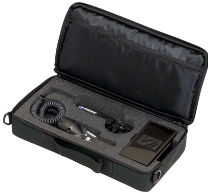
FBP-MTS-001 Fiber Inspection Kit