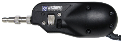
FBP-P505 Probe Microscope