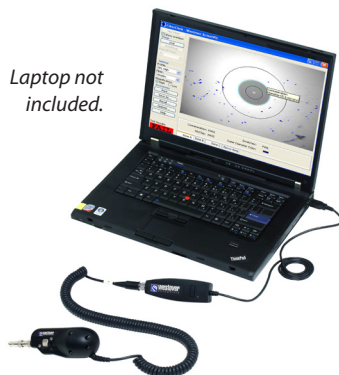
Laptop not included.

The FBP probe microscope connects to the JDSU optical test platforms or to a PC/laptop via a USB digital converter. Simply connect the FBP probe to the module and plug the USB connection in an open USB port. The USB module, like the probe, offers an optional QuickCapture™ button to instantly capture the fiber end face image on the display. For use with a PC/laptop, a fiber analysis program (FiberChek) is included on a CD and requires software/hardware installation. No additional software is needed to interface with these JDSU test platforms: T-BERD, MTS, or TestPad.