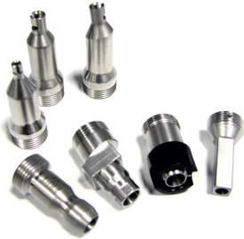
7 Interchangeable Inspection Tips for Inspecting Both Sides of Fiber Interconnect

The Westover FBP video probe microscope, in single or dual-magnification (200/400X), is the essential inspection tool for use with JDSU test platforms. The key components of the probe include an integrated light source, a 1/3-inch complimentary metal oxide semiconductor (CMOS) video camera, a focusing mechanism, and an optional image capture button. It is powered through the universal serial bus (USB) port and utilizes a blue coaxial light emitting diode (LED) light source with an advanced camera system to produce a high resolution fiber end face image. It fits and operates comfortably and easily in-hand, letting users inspect hard-to-reach connectors that are installed on the backside of patch panels or inside optical devices. The focus control is conveniently located on the probe to easily adjust the focus of the fiber image, while the optional dual-magnification control lets users quickly change between high- and low-magnification views.