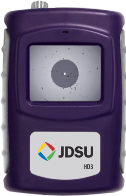
HD3 Handheld Display with 1.8-in LCD