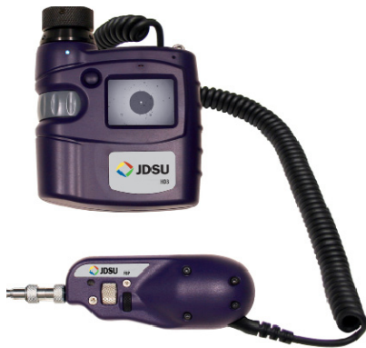
2-microscope System for Quick and Easy Inspection of Both Patch Cord and Bulkhead

Improve Workflow with Integrated Patch Cord Microscope (PCM)