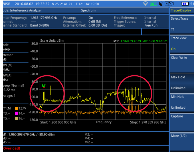
Multiple-peak interference observed in two UL Channels