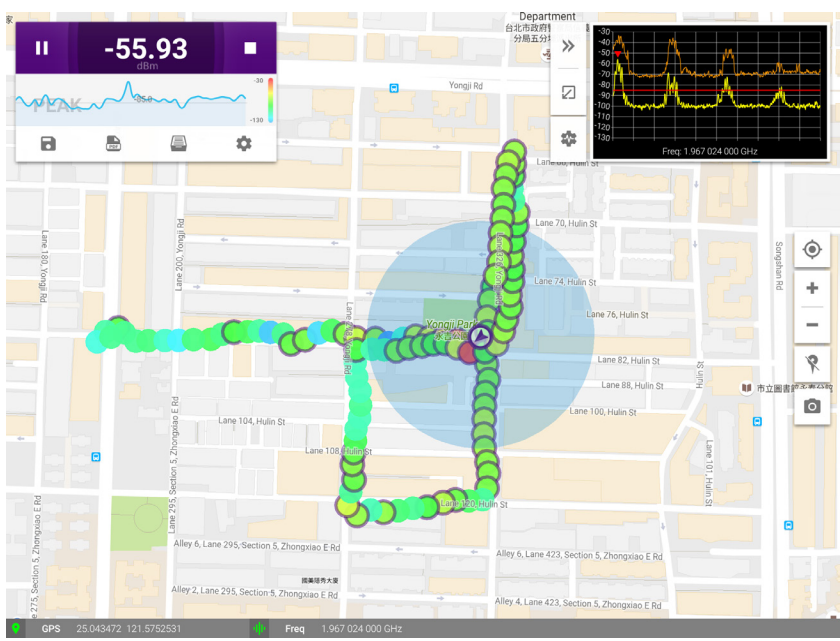
Most probable area found by EagleEye software (large blue circle)

After 30 minutes of drive testing around the strongest signal area, the EagleEye<sup>TM</sup> software indicated the most probable source area.