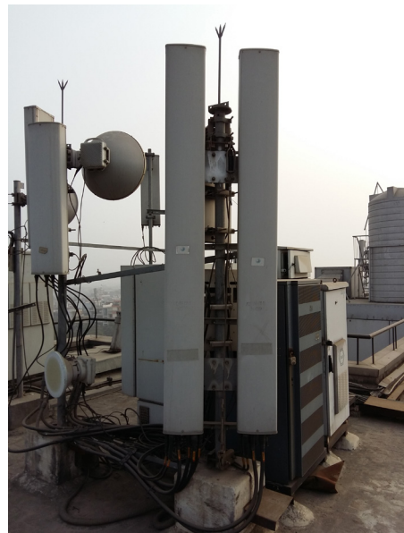
Figure 1: Co-located rooftop cell site

A telco operator in Southeast Asia was reporting high dropped calls in a high profile area. The site serving that area was reporting poor uplink (UL) RSSI, indicating the presence of external interference. The operator spent a significant amount of time troubleshooting the interference issues using a competitor's tool, and was unable to identify the source of interference. At that point, they partnered with Viavi to help them isolate the problem.