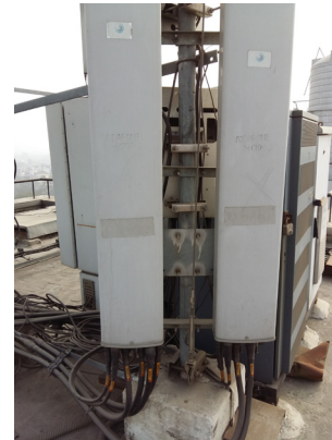
Figure 3: PIM generating antenna

Using the AntennaAdvisor attachment along with the CellAdvisor, the team performed a 360-degree RSSI scan of the rooftop, paying close attention to the Alpha sector. Surprisingly, AntennaAdvisor did not show any peaks, but the team did observe a rise in RSSI noise floor when the AntennaAdvisor handle pointed in a certain direction. This observation really piqued the team's interest, and they decided to perform multiple RSSI scans with the AntennaAdvisor on that rooftop. After performing multiple scans, it appeared that RSSI on UL was maxing near another operator's antenna. Technically, there should not have been any RF energy coming from that operator's antenna into the UL the team was investigating. However, a PIM issue at the other operator's antenna, and the proximity of the two antenna systems, was generating enough RF energy to desensitize the UL spectrum of the Viavi customer.