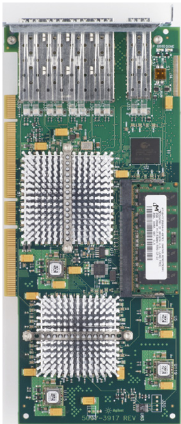
Figure 1. J6870A 10/100/1000 Mbps Blade Interface

Time-synchronize the Blade Interface to an external NTP server. Accuracy \pm 20 msec. Communication is done through the separate GPIO Ethernet port.