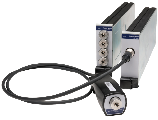
Shown: mOPM-C1 module and remote head with module.

Note: All mOPM-C1 come with 1, 2, or 4 SC (AC903), LC (AC918), or FC (AC901) detector adaptors.