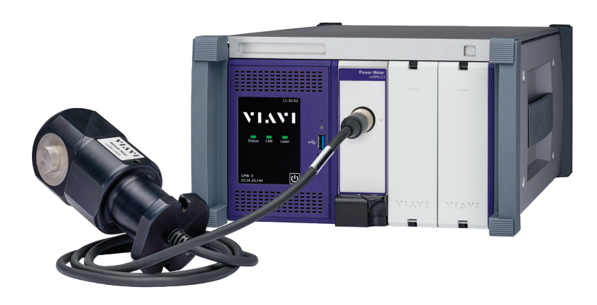
Figure 3 - Integrated Remote Head OPM in MAP-330

The VIAVI integrated remote heads feature a Teflon-based integrating sphere to minimize polarization-dependent loss and access high power. Available as a premium-performance variant and a variant specifically designed for use with MAP-PCT systems, integrated remote heads provide 90° launch and ideal spherical geometry for maximum repeatability. The integrated remote heads can measure high powers of >20dBm and 80dB dynamic range that can be used for amplifier and/or pump laser testing. They also provide a larger input aperture that is ideal for high port MPO connectors or duplex connectors. They are Measure IL for high port count MPO connectors with < 0.01dB positional variations.