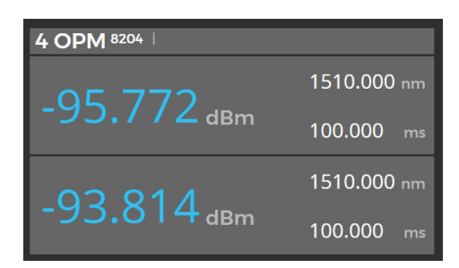
Figure 1 – mOPM MAP-300 summary view GUI

Efficient transition between summary and detailed views (figure 1 and figure 2) allow users to operate at a system level or access the full power of a module.