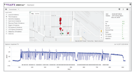
Meaningful Analysis Panel