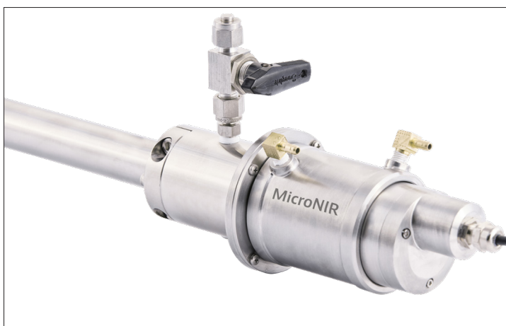
Figure 3. Detail of PAT-L with optional cooling jacket, showing hardwired USB connection.

For more information, please contact your local VIAVI account manager or VIAVI Customer Service at 1-800-254-3684 worldwide or via e-mail at: micronir@viavisolutions.com .