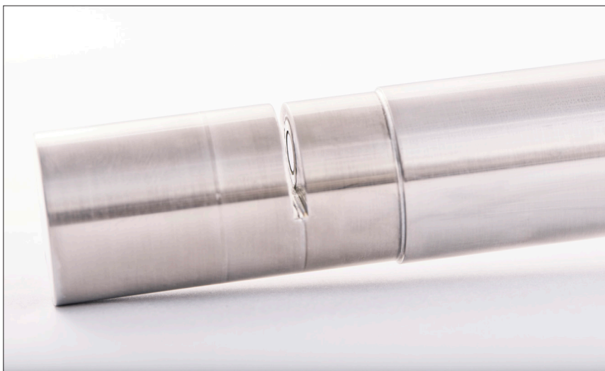
Figure 2. PAT-L showing transmission measurement gap

The PAT-L immersion probe section is based on the Hellma Excalibur HD FPT 26, a well-proven, heavy-duty industrial probe.